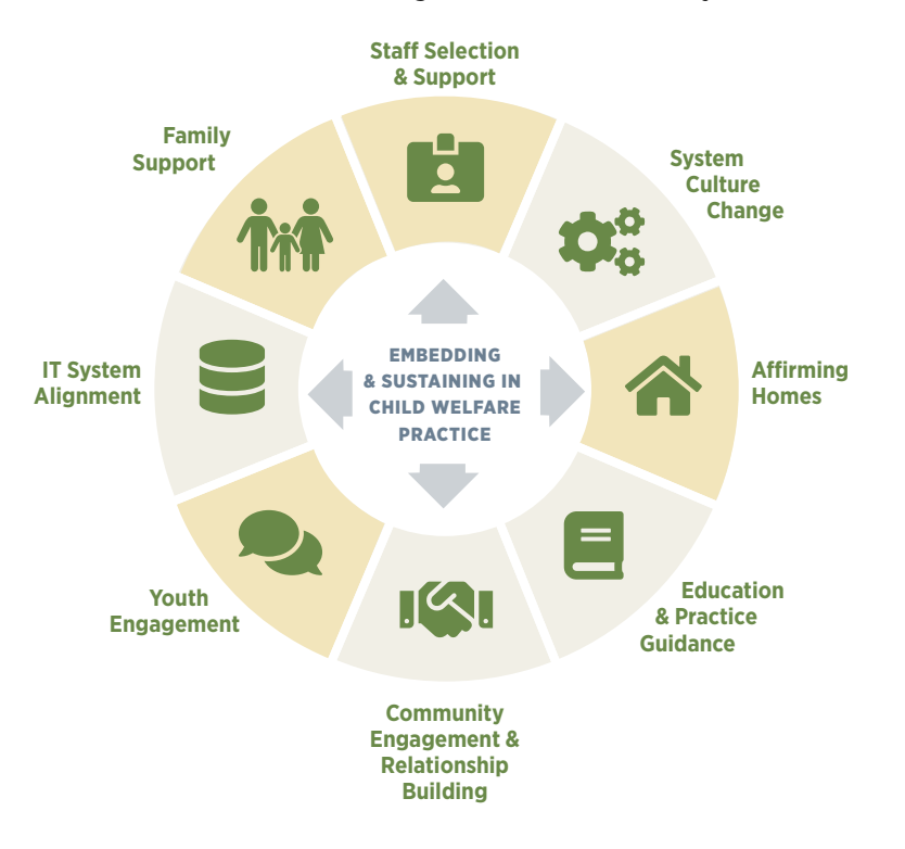
FIGURE 1: Critical Elements of Change in the Child Welfare System

The elements highlighted in yellow are gaps in the system that we plan to address moving forward. Throughout implementation, we struggled to effectively engage youth in planning processes, and improving on this remains a priority. Additional needs that stand out include support for project staff; support for families of origin, particularly families of color; access to affirming resource families; and treatment services and supports that simultaneously affirm both SOGIE and other aspects of identity, such as race, ethnicity and faith.